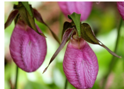
Showdy Lady's Slippers