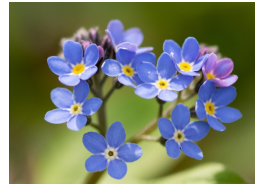
Alpine Forget- Me-Not